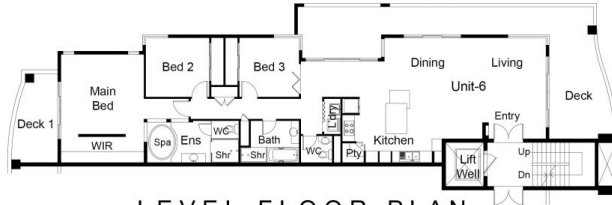
LEVEL FLOOR PLAN